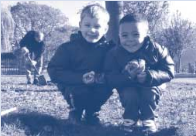
Two youngsters who participated in Make a Difference Day along with Barclays employees across the world.