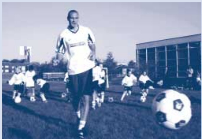
Barclaycard is committed to supporting community football. Through the Barclaycard Free Kicks scheme, over £4 million will be invested in the game at grass roots level during the three-year run of the Premiership sponsorship.