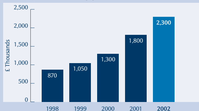
Total funding for free independent money advice support

More than 7,000 budding entrepreneurs were targeted to attend Start Right seminars run by Barclays in conjunction with the National Federation of Enterprise Agencies. During 2002, 353 local seminars were held for people in the early stages of running their own business or considering self-employment. Thirty-four (9%) were held in deprived areas, up from thirteen (3%) in 2001.