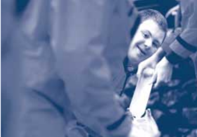
Keppleway is a social enterprise offering activities and education for groups of disabled and able-bodied people. It was funded by The Charity Bank Limited, a community development finance institution supported by Barclays.