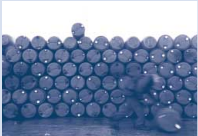
MLE Plastic Recycling Limited has received funds from Salford Money Line, a community development finance institution supported by Barclays.